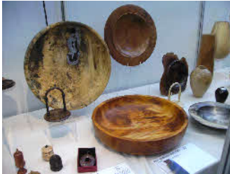
Items from the AWGB stall.