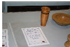
Hinckley's 3rd prize for best stand