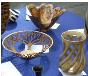
Items from the competition.