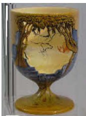
Goblet. Stewart King. The front is cut away to reveal the picture on the inside.