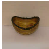
Natural edge bowl in Cherry