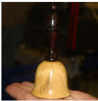
Gary Rance salt shaker