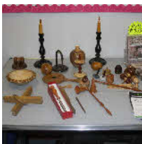
Some of Gary Rance's work