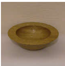
Undercut bowl in Idigbo