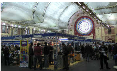
Inside the main hall