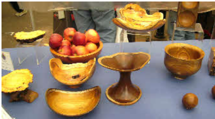
Items from the competition.