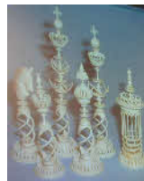
One of many chess sets created by Paul.