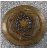
A typical 'rose'.