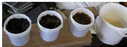
Garnet, Button & Translucent French Polish. Translucent polish ground down ready for meths.