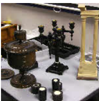
Some of Paul's work.