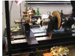
Paul's Holtzapffel rose engine.