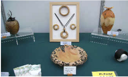
Items from the AWGB stall.