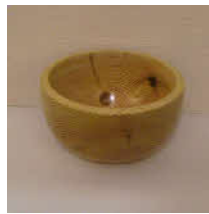
Practise bowl in Pine