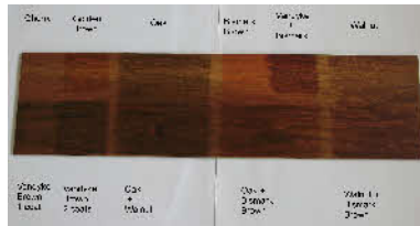
Colouring sample before polishing