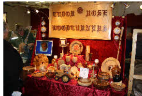
Tudor Rose stand