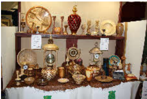
Coombe Abbey stand