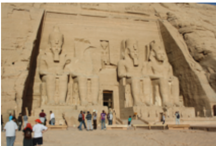
Temple at Abu Simbel