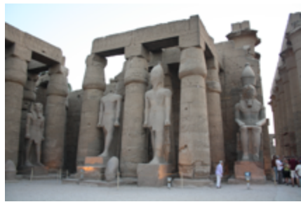
Temple at Karnak