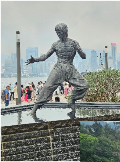
Hong Kong Avenue of Stars Bruce Lee Statue