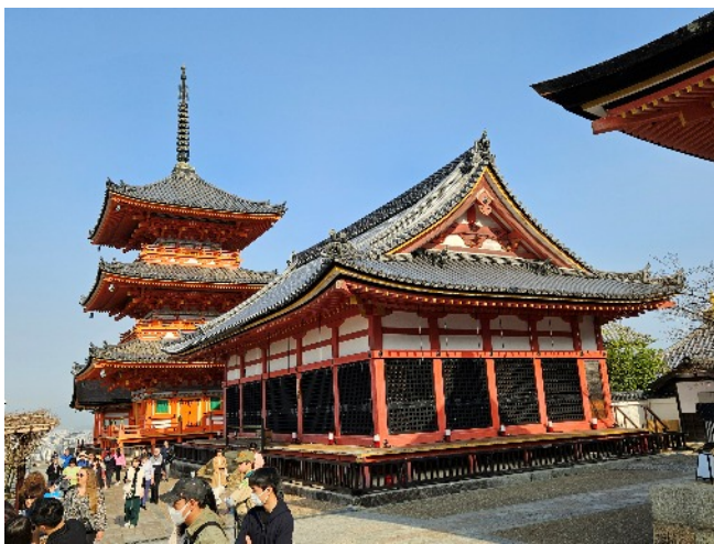
Kiyomizu Temple, Kyoto (778 - 1633)