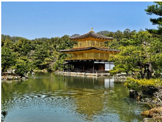
Golden Pavillion, Kyoto (1955)