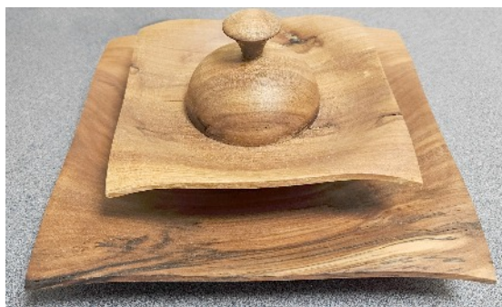
Below - Some of Wolfgang's work