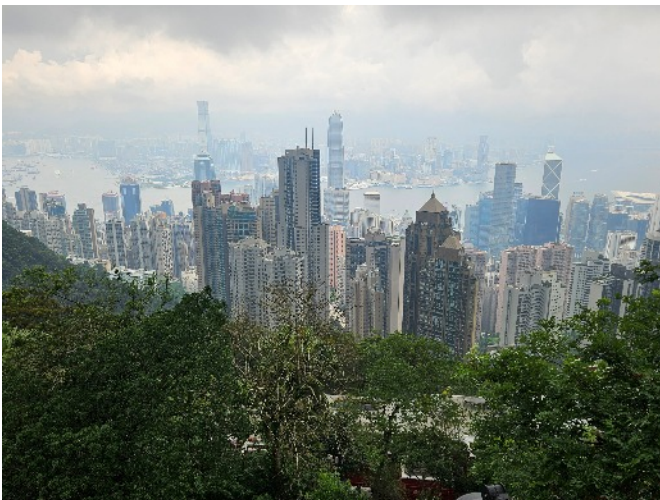
Hong Kong View from Victoria Peak