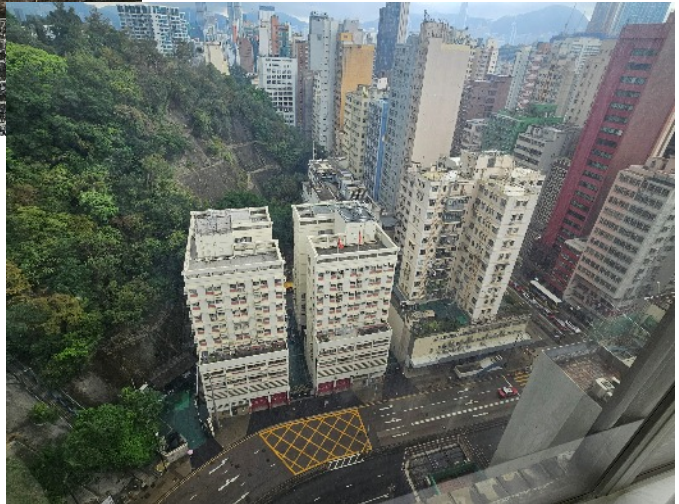
Hong Kong View from my hotel bedroom