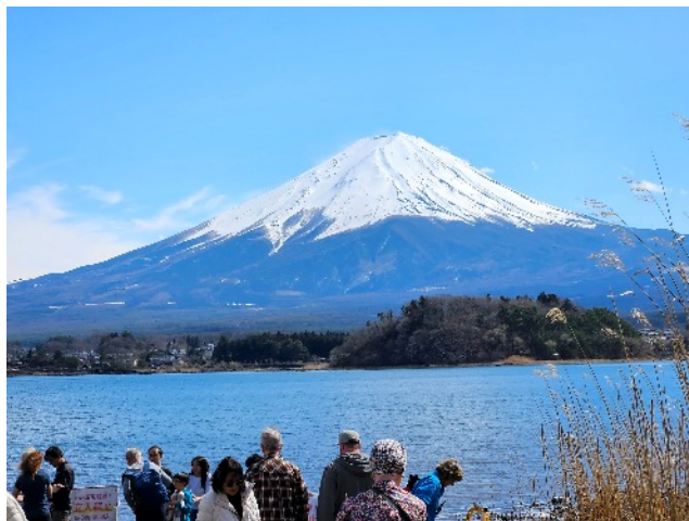
Mount Fuji 3376m high. The volcano last erupted in 1708.