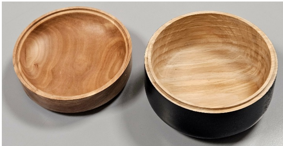
Above - the finished Japanese Style Box