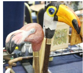
Turn and Burn Walking stick handles