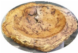
North Wiltshire Woodturning Club