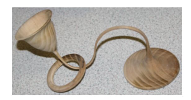
Another earlier version.