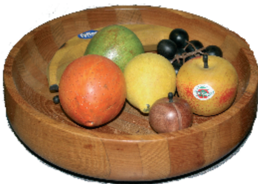
Ron Craythorne 20/3/2012