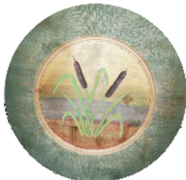
Wolfgang Schultz- Zachau 18/2/2020