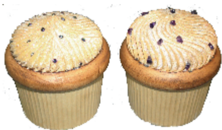
Emma Cook aka The Tiny Turner 19/9/2017