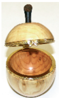
Mick Littlehailes 19/8/2014