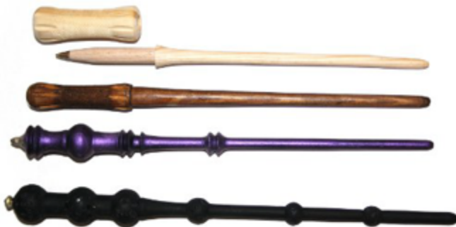
My Wand Pens

AGM next month. Speak to any committee member if you want to raise any issues.