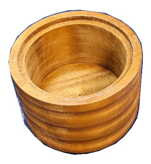
Copyright (c) North Warwickshire & Hinckley Woodturning Club 2024

hollower were very effective in removing material quickly and cleanly. Using a Parting Tool, Chris then cut a recess on the inside edge of the rim on which the lid would sit. He sanded as before, removed any sanding residue with alcohol, sealed and applied two coats of lacquer.