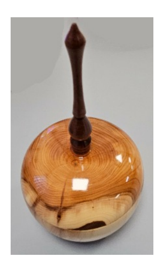
Copyright (c) North Warwickshire & Hinckley Woodturning Club 2024.